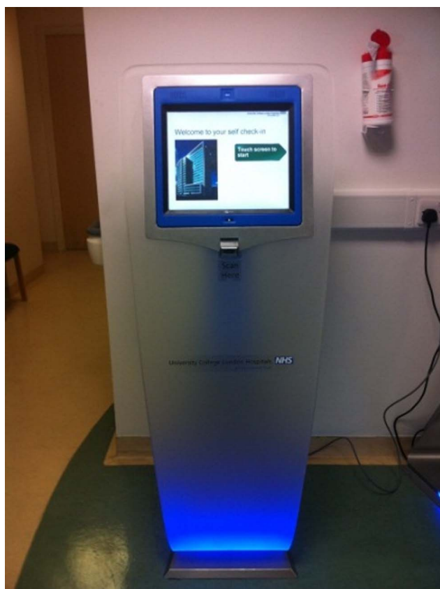
Figure 1 Self-service check-in kiosk.

relation to patients managing their own long-term conditions, for example, diabetes, and anti-coagulant medication: