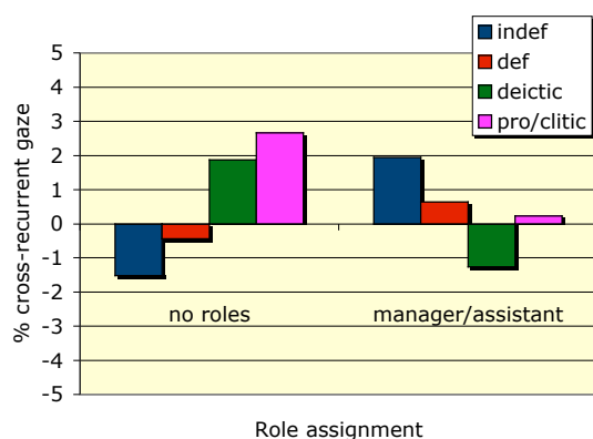
Figure 3 Order of interlocutors' gaze with different kinds of referring expressions: Mean recurrent gaze rates with the negative lags (listener first) less those on the positive lags (speaker first) by dyad role assignments.

To test for this pattern, we examined the shape of the real cross-recurrence curves. Though Figure 2a has clear peaks of aligned gaze at 0 lag (simultaneous), neither figure shows symmetrical cross-recurrence: one side of the tent-like shape is usually higher than the other. By subtracting recurrent gaze where the speaker looked before the listener (positive lags in Figure 1) from recurrent gaze where the listener looked before the speaker (the corresponding negative lags), and averaging the results, we can characterize aligned attention for each of the four accessibility levels within each role type. In Figure 3, negative values mean that listeners followed speakers and positive values mean that listeners preceded speakers.