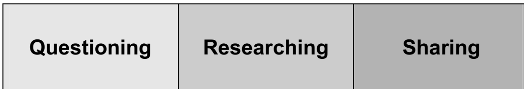
Figure 2: The three phases of the Outdoor Journeys programme

Although there is a distinct and deliberate absence of adrenaline-filled activities, there is plenty of adventure, as the journeys themselves are unpredictable in nature. The concept of broad adventure (see Rubens 1998) that underpins