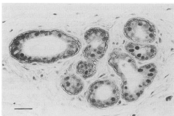
Figure 1 GST P staining in a benign breast lobule. There is staining of both myoepithelial and epithelial cells. Note the staining of occasional parenchymal cells (bar = 85 \mu m).

Table II shows the patients who experienced recurrence after median follow-up of 60 months (range 12–180 months). Five patients had recurrence of DCIS only and five developed invasive ductal carcinoma, including one case of microinvasive carcinoma and two patients with regional lymph node metastases. All recurrences followed high-grade DCIS (grade 2 or 3), usually of comedo pattern. The numbers are too small for meaningful analysis but there was no consistent relationship to GST P expression. Of note is that GST P expression in the recurrent DCIS did not always relate to the GST status of the index lesion, and in one case invasive carcinoma in the recurrence expressed GST P while GST was absent in the antecedent DCIS lesion.