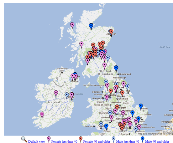
Figure 2: UK-wide speech database.

One of the key elements of the voice-banking project is the creation of a catalogue of healthy voices with a wide variety of accents and voice identities. This voice catalogue is used to create the average voice models for the speaker adaptation and to select the voice donors for the voice reconstruction. So far we have recorded about 500 healthy voice donors with various accents (Scottish, Irish, Other UK). This database is already the largest UK speech research database. An illustration of the geographical distribution of the speakers' birthplaces is shown on Figure 2. Each speaker has been recorded in a semi-anechoic chamber for about one hour using at each time a different script in order to get the best phonetic coverage on average. The database of healthy voices is first used to create the average voice models used for speaker adaptation. Ideally, the average voice model should be close to the vocal identity of the patient and it has been shown that gender and regional accent are the most influent factors in speaker similarity perception [14]. Therefore, the speakers are clustered according to their gender and their regional accent in order to train specific average voice models. A minimum of 10 speakers is required in order to get robust average voice models.