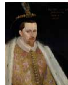
© Adrian Vanson, King James VI, Scottish National Portrait Gallery