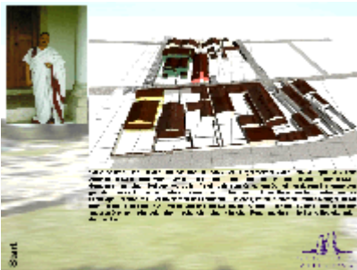
The invitation to join the tour

duumvir offers his tour in three different languages: Latin, English ' Lingua Anglica ' and German ' Lingua Germanorum '.