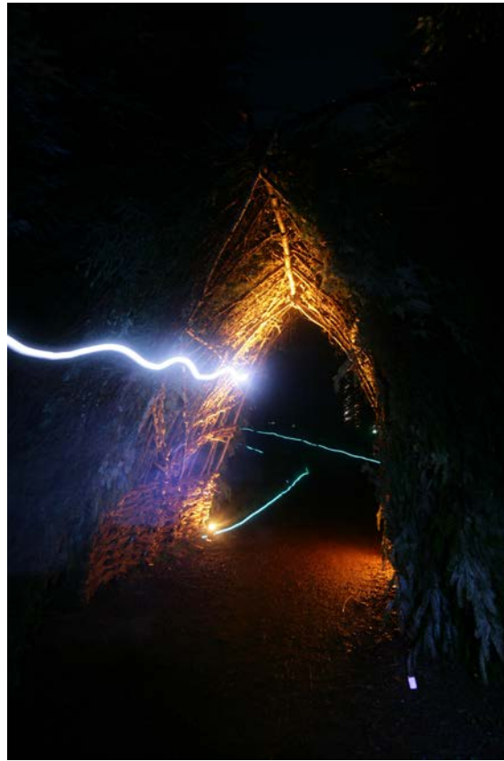
Figure 2: The arch marking the entrance to the woodland

waiting to pounce from between the trees would have been able to see or touch them without warning was visceral.