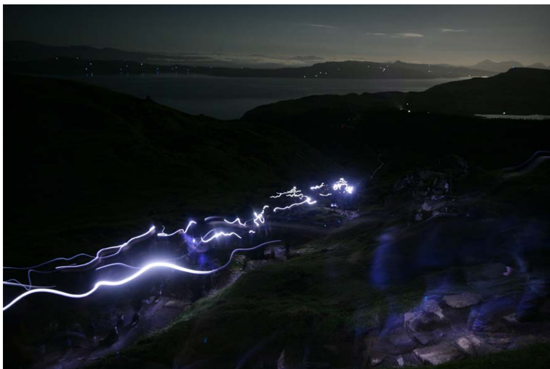
Figure 4: Snaking head torches with the star field behind

looking intently at where they were placing their feet. Standing on the promontory (head torches off) the participants' attention was captured by the silhouette of a woman singing Gaelic ballads on a knoll a short distance away. 163 The woman's voice (amplified by a megaphone, although this was not necessarily obvious to the participants) carried across the landscape moderated by the wind. Beyond her (on clear nights), spotlights on the headlands of Rona and Raasay (see the background in Figure 4) gave the impression of star constellations 'fallen to the ground' 164 and drew attention to a natural phenomenon that many people are denied access to by the bright artificial lights of the city. 165