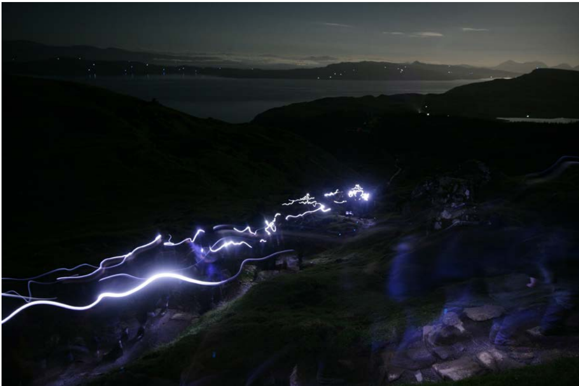
Figure 4: Snaking head torches with the star field behind

looking intently at where they were placing their feet. Standing on the promontory (head torches off) the participants' attention was captured by the silhouette of a woman singing Gaelic ballads on a knoll a short distance away. 163 The woman's voice (amplified by a megaphone, although this was not necessarily obvious to the participants) carried across the landscape moderated by the wind. Beyond her (on clear nights), spotlights on the headlands of Rona and Raasay (see the background in Figure 4) gave the impression of star constellations 'fallen to the ground' 164 and drew attention to a natural phenomenon that many people are denied access to by the bright artificial lights of the city. 165