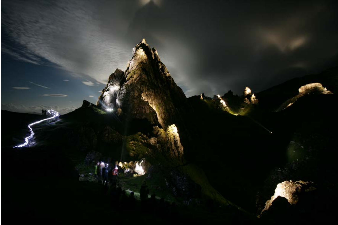
Figure 3: The Coire Faoin and Pinnacles

This was one of only two points in the installation where the participants were returned to the traditional audience role of sedentary receiver of experience. 131 Participants were fascinated by the way in which the lights had focused their attention on specific features,