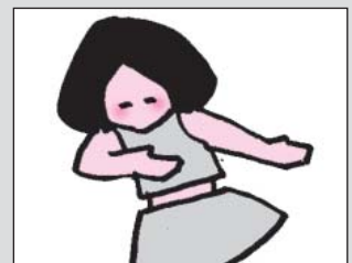
For helping friends and relatives