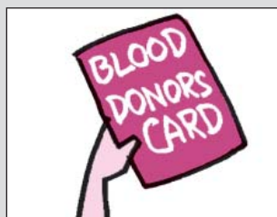
For blood donor's card