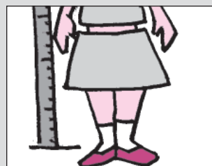
Token of becoming adult