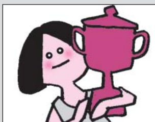
For recognition and awards