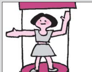
Service to the community