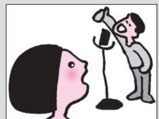
Motivator's appeal or speech