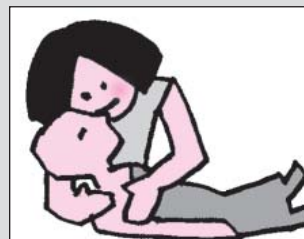
Sense of social duty