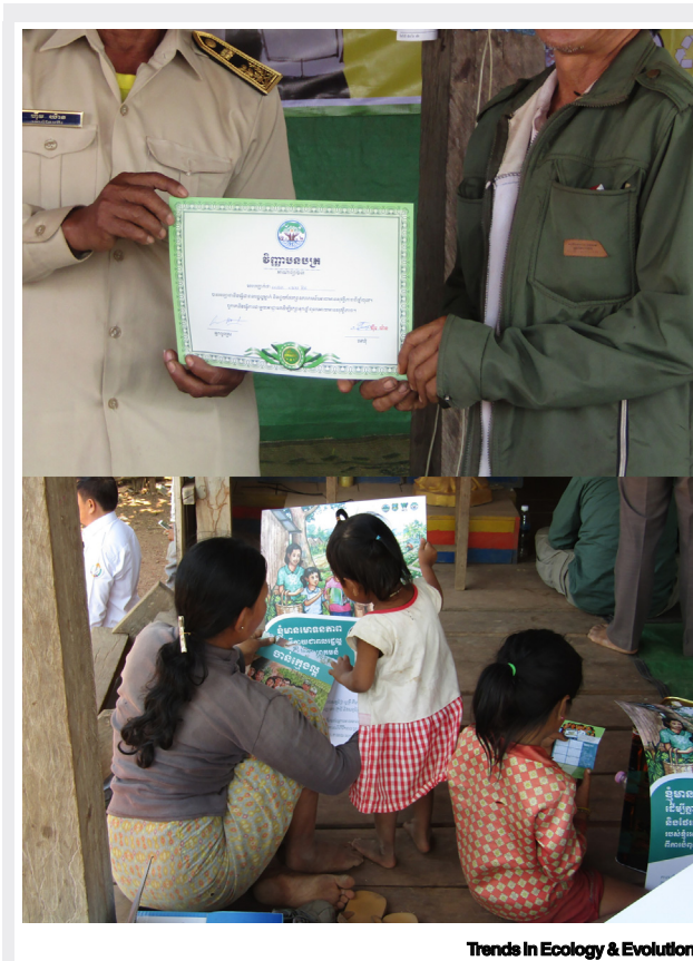
Figure 1. Two Scenes from our Social Marketing Campaign Aiming to Reduce Wildlife Poisoning through Pesticide Misuse. Above: a villager receives a certificate at a public ceremony for pledging to use pesticides responsibly and report misuse. Below: a mother and child look at some of the materials used to transfer information about responsible pesticide use, including the poster given to pledgees.

sufficient to prevent future adoption of negative behaviours [20]. Firstly, televised health warnings may effectively prevent people from trying new pesticides, whereas in communities where use is already widespread, more work might be needed to encourage alternative practices. Secondly, individuals differ in the types of media they consume, so the appropriate channel will depend on who is targeted. In many cases, mass media can be effective at reaching large audiences, but the media habits of the audience must be understood in detail if this is to occur [34]. Interventions targeting a small select group, such as recruitment of change agents or incubator neighbourhoods, may require more personalised approaches involving direct contact by the intervention team. Ideally, interventions aiming to effect widespread behaviour change will make use of a mix of channels, combining the strategies described. For example, workshops targeted to incubator neighbourhoods could initiate adoption while simultaneously mass media could increase the likelihood of diffusion to the wider population.