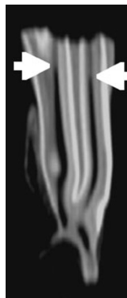
Fig 2: A computed axial tomography scan showing the 1st and 3rd pulps of the 309 of a 6-year-old horse, with arrows indicating transition from pulp to subocclusal secondary dentine.

Some recently erupted Triadan 08 and 11s in the 4-year-old horses contained a large, common pulp chamber without formation of all of the individual pulp horns. For example, the 7th and 8th pulp horns of one Triadan 11 and the 8th pulp horn of another had not yet developed. Some other maxillary Triadan 11s (in horses of all ages) also did not have clearly identifiable 7th and 8th pulp horns, including in Triadan 11s that had marked caudal angulation, where it was technically difficult to follow the contour of the curved pulps with the rigid-blade saw. Overall, the 7th pulp of maxillary 11s was identifiable in 9/17 (53%) skulls while the 8th pulp was identifiable in 10/17 (59%) skulls. The 7th pulp of mandibular 11s was identifiable in 12/17 (82%) skulls. The 6th pulp was identifiable in all maxillary 06s, and in mandibular 06s in 16/17 (94%) of skulls.