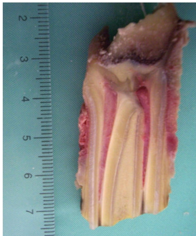
Fig 3: The 2 exposed pulp horns (with 5 and 6 mm of overlying secondary dentine) in this Triadan 107 of a 16-year-old horse are still >2 mm wide apically.

The mean secondary dentine thickness for mandibular cheek teeth was 10.97 mm, and for the maxillary cheek teeth 9.44 mm,