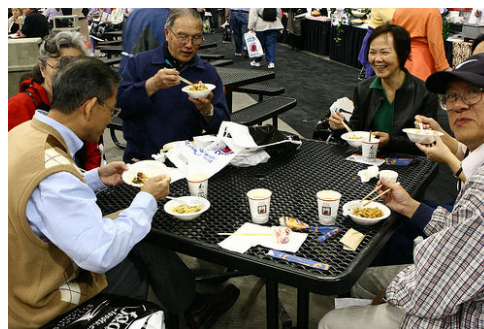
En: A group of people are eating noddles. De: Eine Gruppe von Leuten isst Nudeln. Fr: Un groupe de gens mangent des nouilles.

In addition to releasing the parallel text, we also distributed two types of ResNet-50 visual features (He et al., 2016) for all of the images, namely the ‘res4_relu’ convolutional features (which preserve