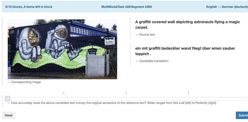
Figure 3: Example of the human direct assessment evaluation interface.

according to the Wilcoxon signed-rank test at p-level p \leq 0.05 . Systems within a cluster are considered tied. The Wilcoxon signed-rank scores can be found in Tables 11 and 12 in Appendix A.