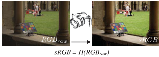
Figure 2: Color correction (mapping raw to display sRGB ) is an homography problem. This figure is also a color chart example which was used for our color correction evaluation.

maps colors in RGI form between illuminants. Due to different shading, the RGI triple under a second light is represented as \underline{c}' = \alpha' \underline{c} H , where \alpha' denotes the unknown scaling. Without loss of generality let us interpret \underline{c} as a homogeneous coordinate i.e. assume its third component is 1. Then, [r' \ g'] = H([r \ g]) (chromaticity coordinates are a homography H() apart). \square