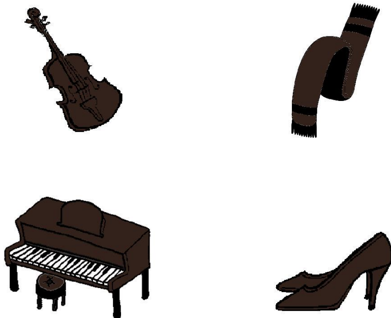
Figure 1. An example picture (for the sentences “The lady will fold/ find the scarf.”).

The auditory stimuli comprised 16 sentence pairs, each of which had two conditions, differing only at the critical verb (see Appendix for a full set of items). In the predictable condition, the target object was the only appropriate patient of the verb among four depicted objects (e.g., “ The lady will fold the scarf. ”). In the unpredictable condition, any of the depicted objects could plausibly be the patient of the verb (e.g., “ The lady will find the scarf. ”). The sentences were recorded by a female native British English speaker, and sampled at 48 kHz with a format of 32-bit float. The speaker read the sentences at a rate of 1.3 syllables per second with some pauses between phrases (following Altmann & Kamide, 1999). The mean durations for the critical verbs and target nouns were 870 ms and 1098 ms respectively. The relatively slow speech was intended to create optimal conditions for predictive eye movements, such that any effects of load or population would be easy to observe.