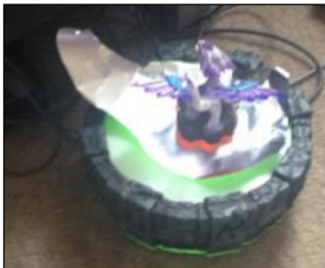
Figure 5: Curiosity about IoT technology when prompted

Although there are various online discussions of how the IoT toys work, in our research there seemed little reflection from parents or children unless prompted. When asked, children and parents tended to refer to the bases scanning the objects as having similarities with scanning barcodes in a supermarket. One child pointed to the numbers on the base of the toy that were being 'read'. When this child was shown that the bases could detect toys through a magazine, they became fascinated with the technology. A five-minute exploration of the technology culminated with the child finding out that tin foil blocked the RFID communication. This interest was explored further in the school workshop.