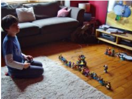
Figure 2 Skylanders toys lined up and displayed

2). Comments on forums and clips on video sharing sites also support the idea that children were proud of their toy collection.