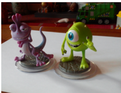
Figure 1: a) Skylanders and b) Disney Infinity figurines

Both Skylanders and Disney Infinity consist of plastic figurines (Figure 1) that when placed on a portal (plastic base) result in a corresponding virtual avatar being selected within the game which children can subsequently control in a typical fashion using a game controller. It is possible to place more than one character on the base depending on the system and particular game selected.