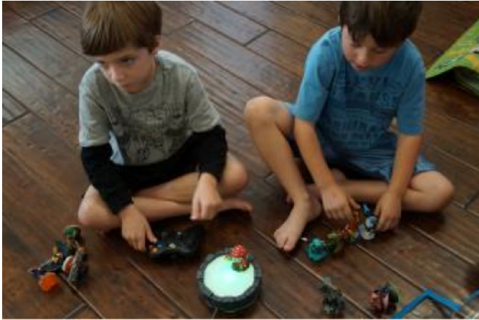
Figure 4: Two forms of activity (OC Mom Blog, 2012)

also played in single player mode, taking turns to control the game. The non-playing children would generally watch, although several Internet images show the non-video playing child to be interacting with the physical toys whilst waiting (e.g. Figure 4).