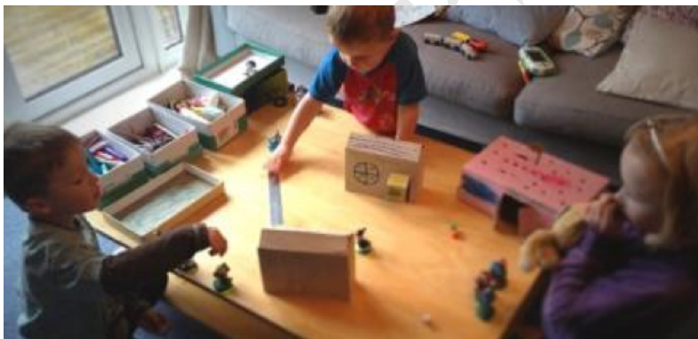
Figure 3: Physical toy play (Robertson, 2012)

“With growing interest at what the next technological and gameplay step will be for the Skylanders, I find it more than a little ironic that my kids seem to spend increasing time playing with our collection of Skylanders figures away from the game.” (Robertson, 2012)