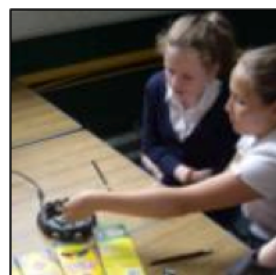
Figure 6: Exploring the computing components inside Skylanders toys and base