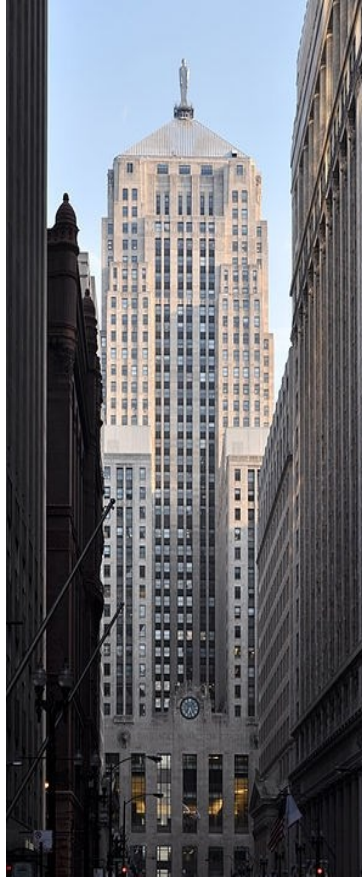
FIG. 6 The Chicago Board of Trade building, designed by Holabird & Root. 2011 photograph by Joe Ravi. Creative Commons license CC-BY-SA 3.0.