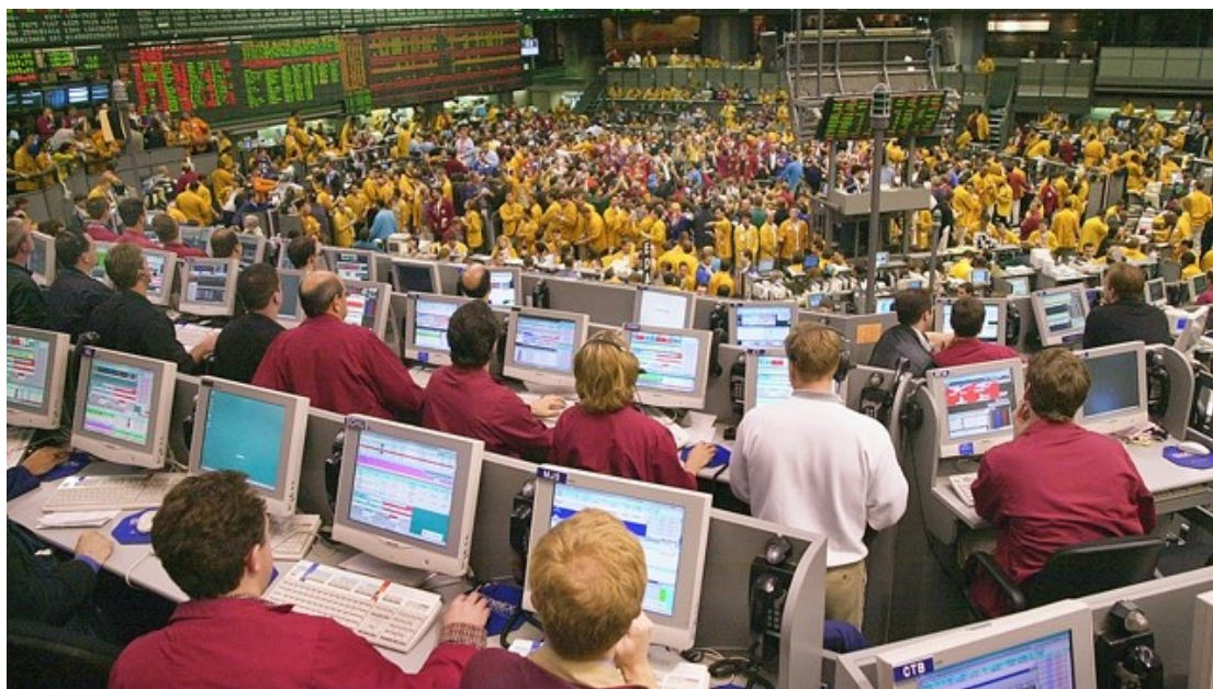
FIG 4 Globex terminals overlooking the Merc's S&P 500 trading pit, c. 2000.