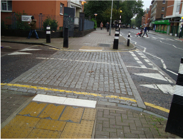
Figure 9. Tactile paving and sets are uncomfortable and can lead to imbalance