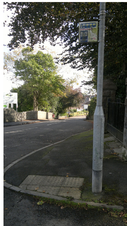
Figure 15. Multiple hazards – slope, tactile paving surface, moss and road crossing

During the workshop with falls practitioners there was general agreement that items included in the checklist that was presented were sufficient to be useful and reasonably comprehensive, although a few suggestions were made. In general, the idea of a checklist similar to those currently used inside the home was welcomed, although it was stressed that falls practitioners would need training and guidance on how to use the checklist and what follow-up actions could be taken. There was a general consensus that the outdoor environment is not considered as much as the indoor environment by falls