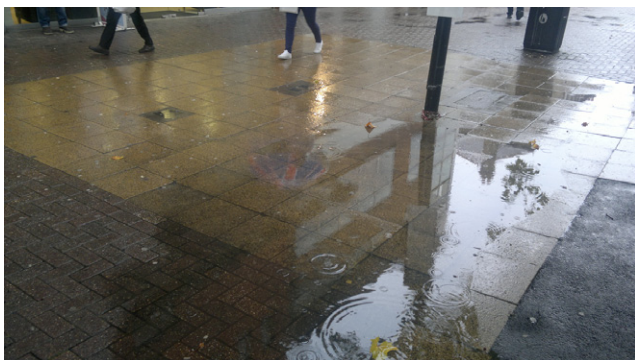
Figure 13. Accumulation of water during wet weather conditions may increase slip risk

The weather is a dynamic factor, having a significant impact on falls and falls risk. As shown by Figures 13 and 14, if the street environment is not designed or maintained well, then during certain weather conditions falls risk can be enhanced, as certain surfaces will become slippery and people may have to detour. Icy conditions, in particular, are likely to lead to an increased falls risk. Windy conditions can also cause imbalance problems for older people. Urban environments should be designed to