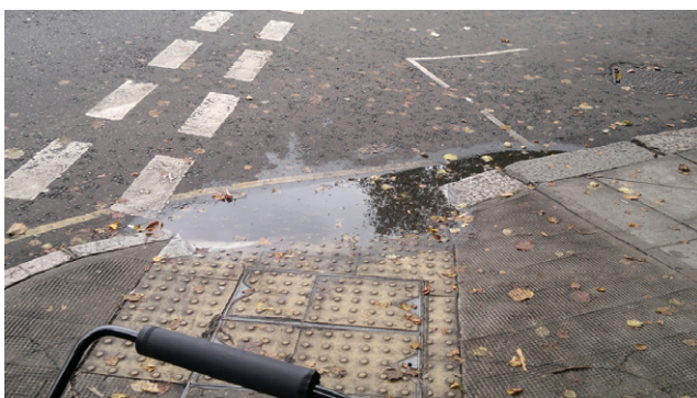
Figure 14. Uneven pavement and accumulation of water makes this road crossing challenging

ensure that wind tunnels are not created by tall buildings, taking into account the direction of prevailing winds.