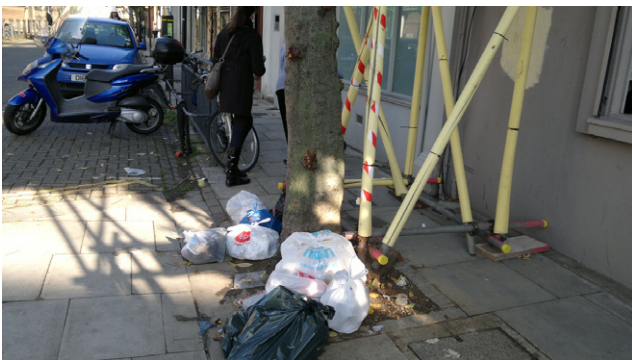
Figure 11. Multiple temporary obstructions – litter, scaffolding and parked bicycle