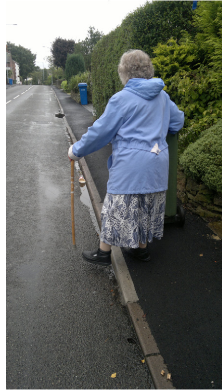
Figure 12. Temporary obstruction causing change of route and change in levels

vehicles or dustbins or feeling uneasy due to streets crowded with people. This highlights how obstructions can be dynamic and that the social environment is also an important factor in assessing falls risks, as has previously been highlighted (Nordbakke, 2013).