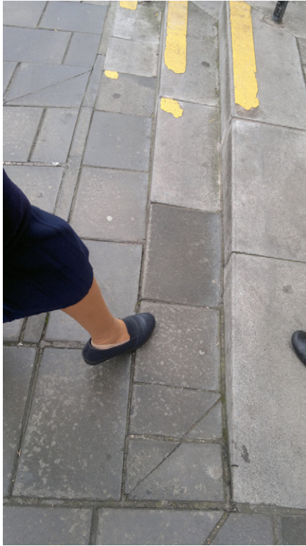
Figure 5. Changes in levels – tapered steps require greater concentration and are a source of stress