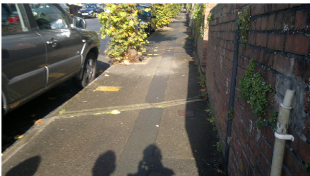
Figure 2. Changes in levels – drain across pavement

As shown in Figure 4, changes in levels may be sudden or more gradual. Slopes, as well as steps, present a problem. It must be noted, however, that each individual usually had a preference for one over the other, depending on individual capabilities. It is therefore difficult to suggest that either ramps or steps are preferable to those at risk of falling, but rather that