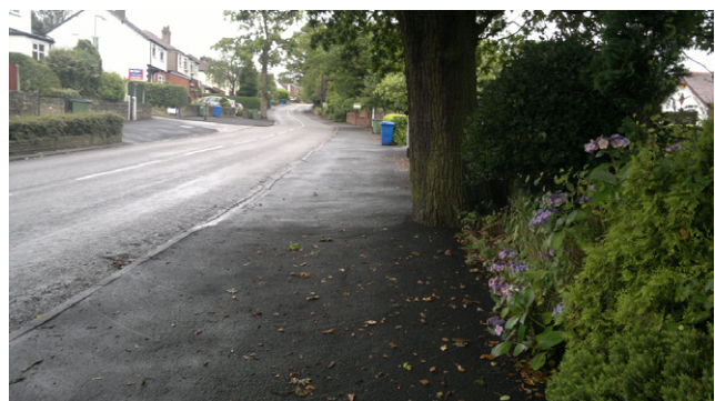
Figure 8. Most participants said bitumen was the most comfortable surface to walk on