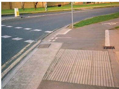
Figure A5. Tactile paving

Many older people find tactile paving uncomfortable to walk on and likely to cause loss of balance or be slippery (Figure A5).