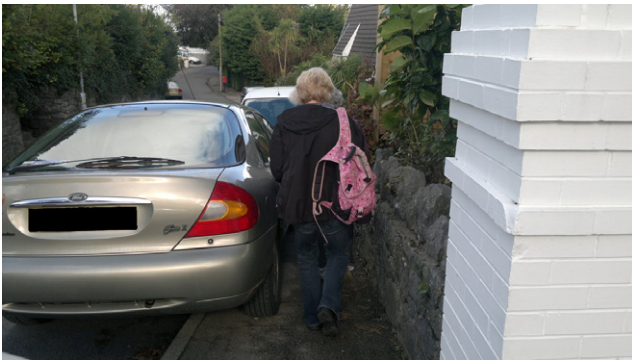
Figure 10. Temporary obstruction – parked vehicles