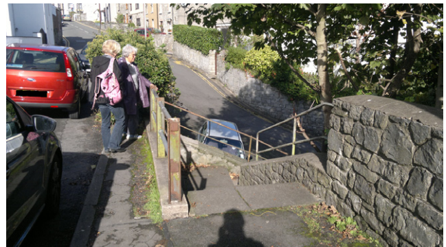
Figure 4. Changes in levels – steps and slopes

an inclusive environment would include both options for changing levels.