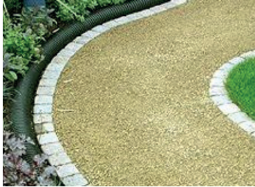
Figure A4. Hoggin

Hoggin (bound gravel or sand creating a firm and smooth surface) can be good for grip but can also cause loss of balance depending on the roughness of the surface (Figure A4).