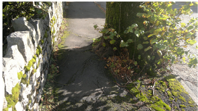
Figure 7. Bitumen surface made uneven by tree roots