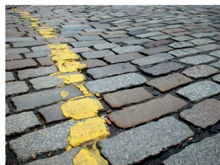
Figure A3. Setts

Setts are uncomfortable and likely to cause loss of balance (Figure A3).