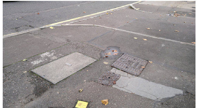
Figure 3. Changes in levels due to manhole covers