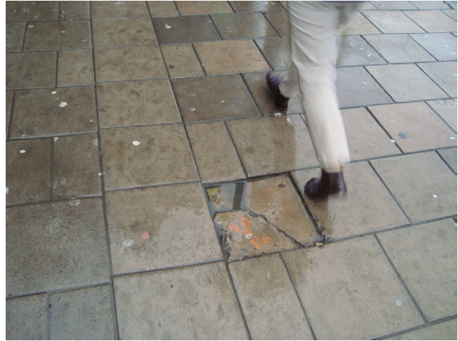
Figure 6. Cracked paving flag and wet conditions

Obstructions along a route can cause loss of balance, create uncertainty or cause detours that may result in falling. Obstructions may be permanent, such as fixed rubbish bins and benches, or temporary such as vehicles, dustbins, litter or billboards (Figures 10–12). Obstructions present various kinds of hazard. Examples from the interviews include a slip hazard caused by vegetable peeling, having to manoeuvre around