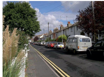
Figure A1. Bitumen pavement

Asphalt in good condition is the most suitable surface for good grip and least changes in levels. Asphalt/bitumen – black-top (tarmac) pavement (Figure A1).