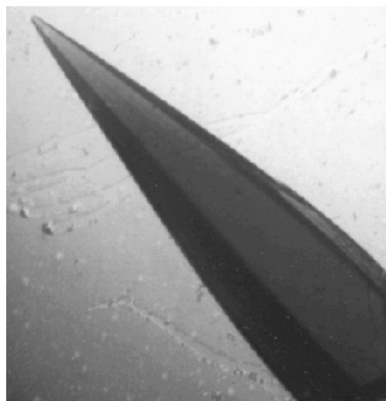
Figure 1 Native crystals of P450 MT2 (CYP121) grown by the hanging-drop method.