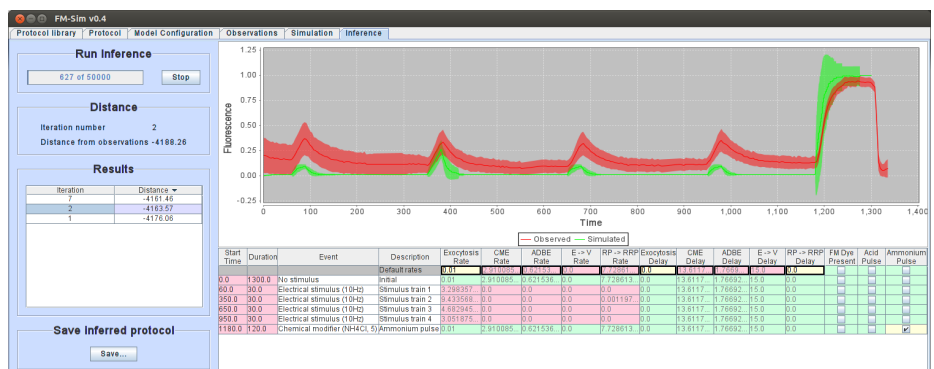
Fig. 2. Example parameter inference of a defined protocol, the parameter values in red are inferred from observed experimental data. The graph shows a sample simulation using these parameter values compared against the supplied experimental data.

Once defined, the set of protocol events are converted into a sequence of rate change events for simulation (Figure 3). At each rate change event, the set of rate values in effect are calculated, accounting for value inheritance. A single value is used for each inferred protocol event parameter when generating Bayesian inference proposals, ensuring consistency if that parameter value is used in multiple rate change events. This simplification of protocol definition entry and automatic rate event generation with inherited rate values is a feature not found in many of the general purpose simulators currently available, such as VCell [8].