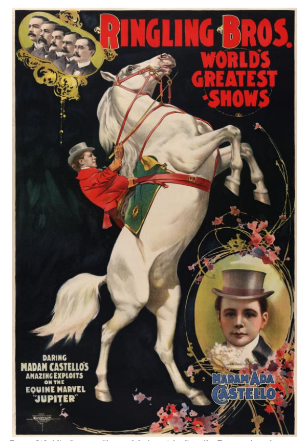
Fig. 2 Ringling Bros. World's Greatest Shows: Madam Ada Castello. Promotional poster for Ringling Brothers by the Coach Lithographic Co., Buffalo, New York, ca. 1899.

movement is once again framed as an interplay between external prompt and involuntary response; this 'idiot dwarf' is 'hooked to a wire to make him jump', recalling the 'wire-pulled automatons' and 'horrible marionette' of Wilde's decadent poem 'The Harlot's House' (1882), which also depicts an automated mode of eroticism communicated through impersonal gestures and movements.<sup>49</sup> As such, the artifice-laden choreographies of 'Crab-Angel' expose both the performative appeal of the circus and the similarly constructed nature of sexual and racial categories, inscribed at surface-level through the body's mechanisation.