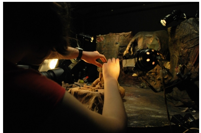
Figure 1. A stop-motion animator adjusting the head of a chrysalis character

We illustrate this issue in the dichotomy between traditional physical Stop-motion and digital Computer Graphics aided animation and further explore it as a case-study. Our design-led research explores the application of intuitive interfaces and creative mapping for transferring the rich tacit skills of traditional Stop-motion practice in a digital setting.