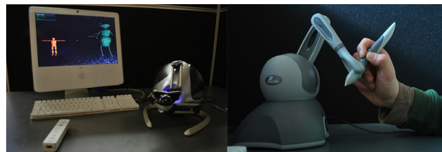
Figure 3. The setup with Novint Falcon and the Wii Remote (left) and the Sensable Omni™ (right)

We employed two haptic interfaces: the Sensable's Omni™, a stylus-type, six-degrees-of-freedom (DoF) haptic device and the 3-DoF Novint Falcon device which could not provide rotation (Figure 3).