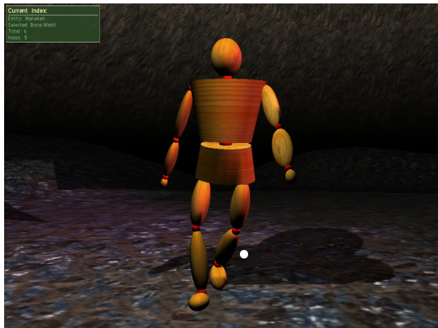
Figure 2. The 3-D virtual space. The white sphere is the visual representation of the haptic device

The workspace (Figure 2) was a 2 1/2 D space on the computer screen with no other graphical user interface apart from a text area that displayed the performed actions and kept track of the Key-frames 2 timeline. Keyboard buttons were used for the basic animation actions such as Set/Advance/Retrace a Key frame and Stop/Playback animated movie sequence. A 3-D sphere represented the haptic device in the digital space and followed its movement. The virtual scene included a customizable 3-D background and a set of virtual characters modeled as rigid bodies. A Skeleton, a hierarchical chain of bones and joints, was attached to each body and was given dynamic properties through a kinematics algorithm. There are two main kinematic algorithms, Forward (FK) and Inverse Kinematics (IK). In FK, if a bone is moved or rotated, the bones that follow it in the chain move accordingly. In IK, motion of an end bone determines the motion of the chain (i.e. if fingers are moved then motion of all joints up to the shoulder is computed automatically ). We have initially chosen to work with FK since the animators highlighted the necessity of having total control over the character's motion. For the same reason, we did not implement interpolation 3 or other form of algorithmically-driven automated motion computation between posed frames. In order to keep the virtual space simple, no physics were implemented.