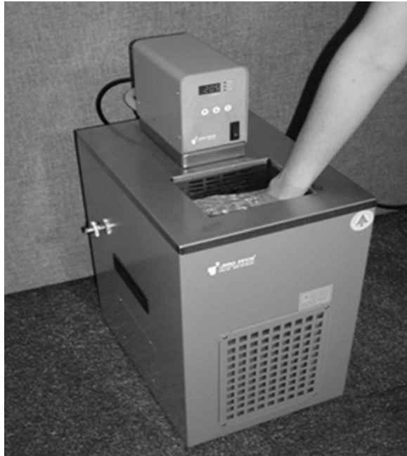
FIG. 2. Cold Pressor used in the pain experiments.

used, with each participant undergoing three cold pressor trials. Stimuli were presented in counterbalanced order, and test conditions in the experiments were as follows.