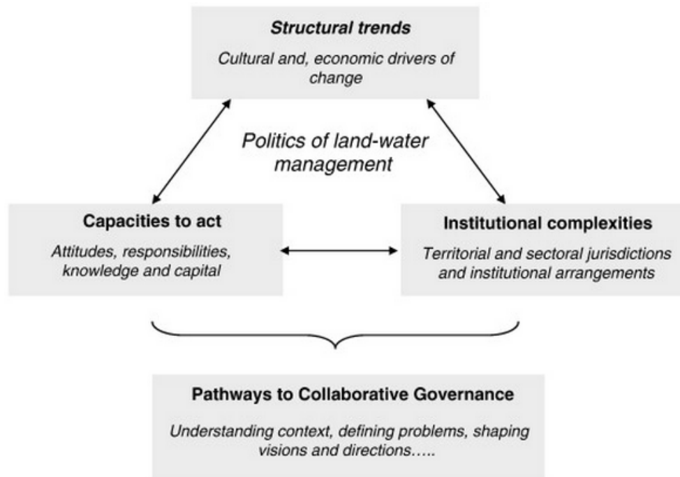
Figure 2. The thematic scope of social sciences research in IWAM..